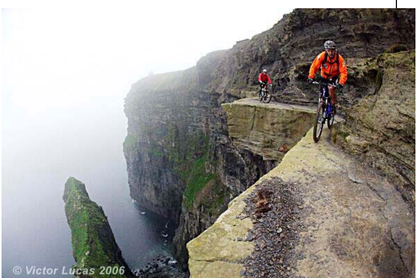
When bicycle helmets make no sense.